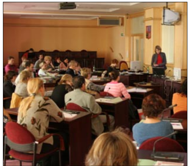
The third information seminar to the LA21 in Plzen was also a great success

The set of 21 criteria and their indicators that measure the quality of LA21 advancement in cities and municipalities, originated last year on the grounds of the Work Group for